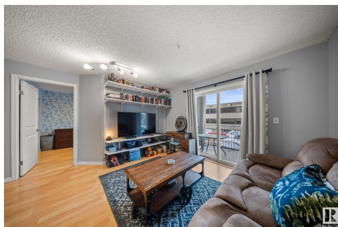
214-10535 122 St NW, Edmonton, AB